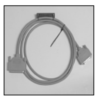
Cable for V.24/RS232 standards with test plug