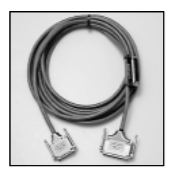
Cable for RS530 standard with test plug

Note: The SYNC MAX ISA adapter package includes the cable or cables you specify when you order the product. If you need to change communication interfaces, you can order the other cables separately from Barr Systems. The SYNC V.24 RS232 ISA adapter package includes the V.24/RS232 cable.