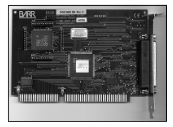
SYNC MAX ISA adapter

The SYNC ISA package includes one of these adapters: