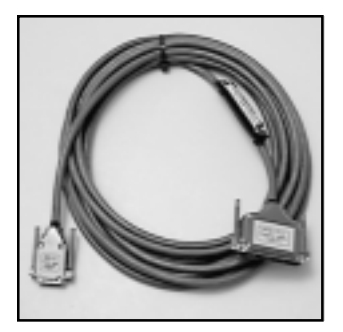
Cable for X.21 standard with test plug