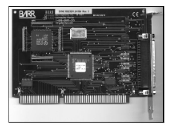
SYNC V.24/RS232 ISA adapter