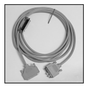
Cable for V.35 standard with test plug

The package also includes one of the following cables, depending on which interface you specified: